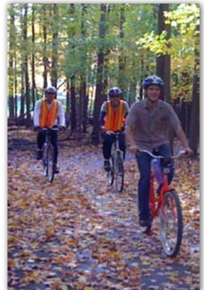
Walking or biking the trails is a great way to enjoy the watershed!

such a good time, she joined us again for our fall paddle from Irish Road to Mott Lake, where she noted that the Flint River reminded her of the rivers up north. Check our website calendar for 2011 dates! You don't want to miss out on all the fun!