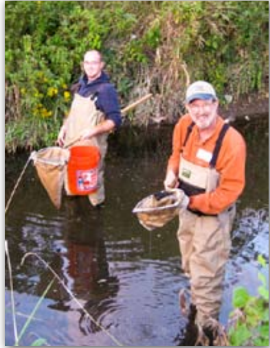
Two of the many dedicated volunteers that help monitor our water quality

In September, a total of 30 volunteer monitors attended one of three FRWC MiCorps trainings designed to bring our monitors up to speed on this exciting program and process. This fall season, 31 monitors collected data from one or more sites in Genesee and Lapeer Counties. We sincerely appreciate their time and effort! Since 1999, FRWC has been coordinating this effort to report on the health of our rivers and streams.