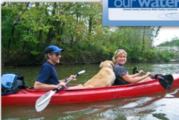
Summer fun - Paddling with your pooch!

River Walks began in April on the Flint River Trail. This walk provided walkers with first-hand view of urban effects on the Flint River.