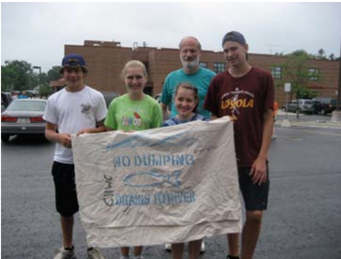
Storm Drain Stenciling photo of Davison's Catholic Heart Work Camp

Residents in the Village of Goodrich and Davison Township now know a little more about how they can prevent pollutants from entering our streams. With support from the Our Water program, the FRWC is working with various groups around Genesee County to raise awareness about the impact of storm drains in our watershed. Most recently, the Catholic Heart Workcamp program joined in our efforts, with youth from Pennsylvania, Illinois, Tennessee, and Wisconsin stenciling storm drains and distributing information to over 500 residents on Seven Simple Steps to Clean Water. We appreciate their efforts in helping us educate residents in the Kearsley Creek and Thread Creek Subwatersheds on how they can reduce contaminants from entering our rivers and streams.