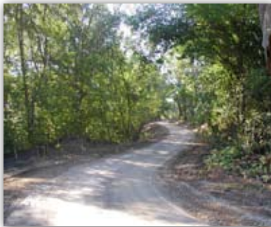
Trail headed west toward Ballenger Hwy

The new pathway will run from downtown Flint near the State Building next to the University of Michigan - Flint to Ballenger Highway where it will turn north along Ballenger at McLaren Hospital. This section is Phase One of two (2) phases. The preliminary engineering is complete for the second phase which will follow the Flint River along its north bank to Linden Road through Flint Township.