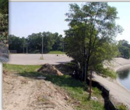
Under construction near Atwood Stadium