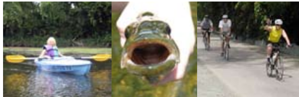
Paddling, Fishing & Biking Are all great ways to enjoy the watershed!

in over 350 fishermen and women and over 5,000 persons for its outdoor expo, fish dinner, and other entertainment and activities. All summer long, the fishing throughout the entire watershed has been grand.