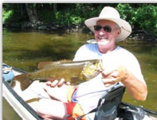
Dad with the 20 inch smallmouth that almost capsized our canoe

such a good fishery was this close to my home," he said after several more fish. Before the day was over Dad had boated over 40 fish including several trophies. The largest fish of the day was a 20 inch bruiser that drug our canoe into a bolder field and nearly caused us to capsize. What a hoot!