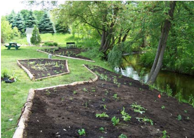
Site: Native Stream Buffer at Kearsley Creek, in Ortonville, Michigan

Mill is often used for community events such as the Ortonville CreekFest, the buffer is designed to leave as much open space as possible and still be wide enough to function well as a buffer. The design incorporates a pathway down to the Creek, with a smaller garden with