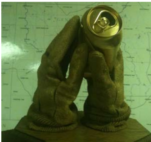
The Coveted Golden Gloves!

The snow may still be coming down, but spring will be here before you know it. Last year, 270 volunteers removed over 296 bags of trash, filled 53 yards worth of dumpster space, and hauled 99 tires from the river and its banks, all while competing for the coveted "Golden Gloves" award