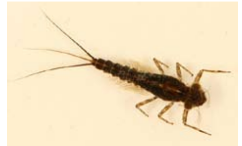
Mayfly Larva

Its going to be a great year! See you on the River!